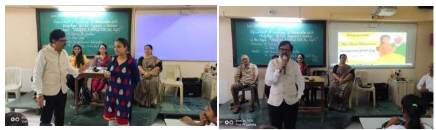
LECTURES AND INTERACTIONS